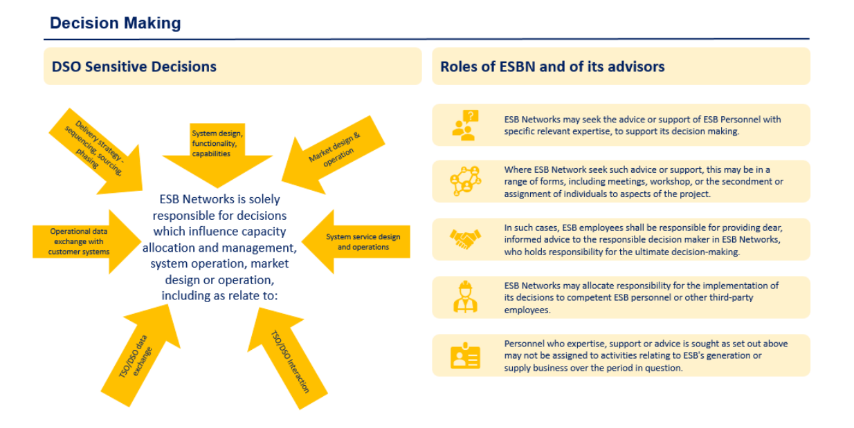
Figure 5.2- Components forming the DSO sensitive decisions and roles of DSO and its advisors in decision making