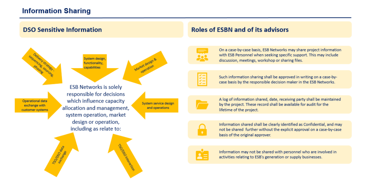
Figure 5.3- Components associated with DSO sensitive information and roles of the DSO

Figure 5.2- Components forming the DSO sensitive decisions and roles of DSO and its advisors in decision making