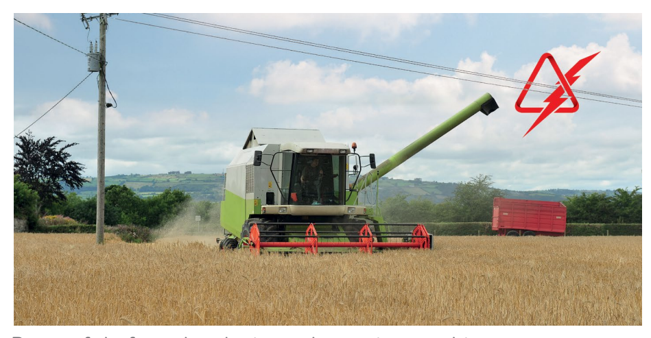
Be careful of overhead wires when using machinery.

Machinery and high loads electricity can jump gaps