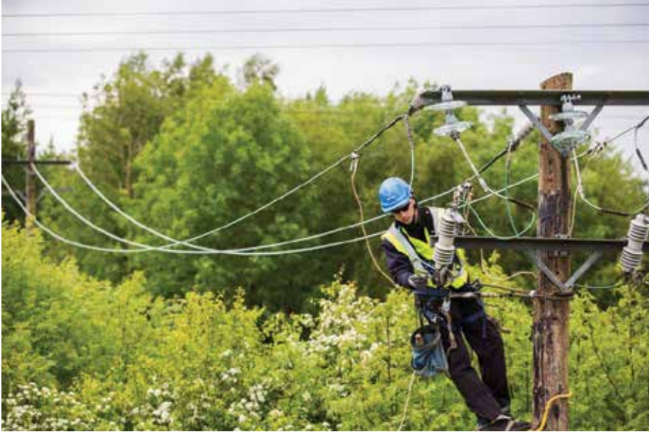
Network technician repairing fallen wires after a storm.