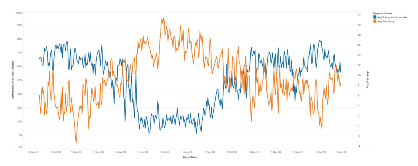
FIGURE 2: TEMPERATURE & ENERGY CONSUMPTION EXTREMES RECORDED DURING THE TRIAL

FIGURE 3: AVERAGE ELECTRICAL ENERGY IMPORTED (BLUE) VS AVERAGE METEOROLOGICAL TEMPERATURE (ORANGE) FOR THE FLEET OF SUPERHOMES OVER THE PERIOD JANUARY 2018 TO MARCH 2019.