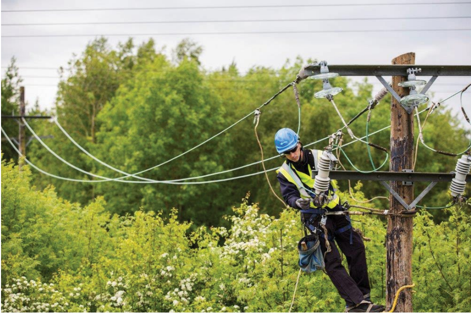
Network technician repairing fallen wires after a storm.